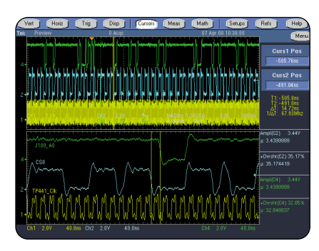
Figure 2. Sophisticated analysis capabilities allow users to fully characterize and document design performance.

The adaptable TDS6000 Series human interface readily supports any operating style and environment. Select traditional instrument-style buttons for navigation or switch to a Windows menu bar. Classic analog-style controls provide instant access to the most frequently used functions while the large touch sensitivity display provides intuitive menu operation. Directly drag waveform positions, cursor locations and trigger level using the touch screen or a mouse. Use a graphical drag-box to select a waveform area for zooming, histogram analysis or measurement gating. Use the MultiView zoom to rapidly navigate and compare multiple waveform regions without losing the "big picture." The USB interface allows a mouse, keyboard and other peripherals to be added without powering off the instrument. With this flexibility, the oscilloscopes readily adapt to a cart, cluttered bench top, shelf, floor and other locations that frequently make operation awkward.